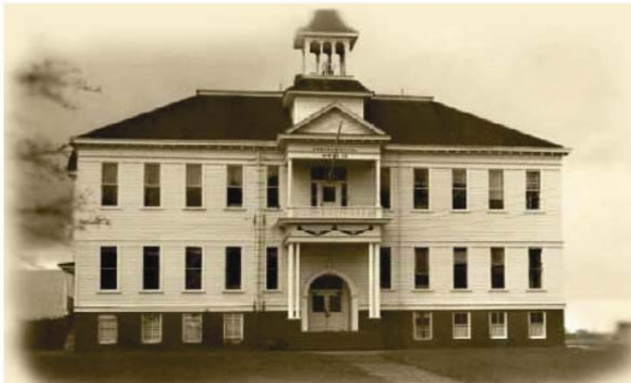
Old Coburg School – Est. 1912

Adopted September 20, 2005 Ordinance No. A-200